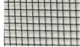
Fire Mesh (Stainless Steel)

An economical choice. If properly maintained, it will not rust, rot or corrode.