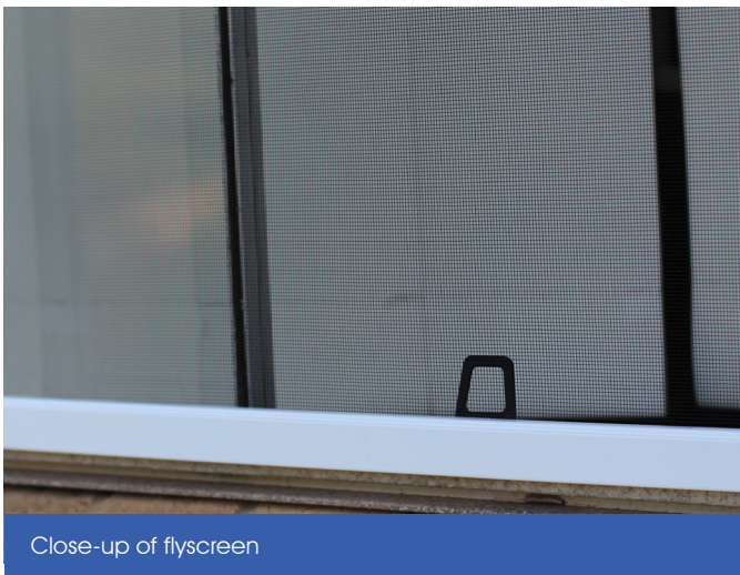
Close-up of flyscreen