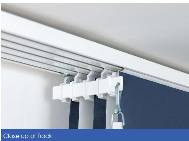
Close up of Track