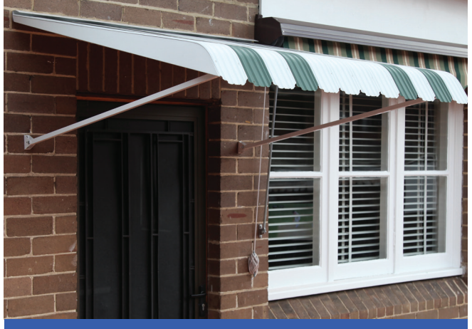
Close up of Standard End Caps