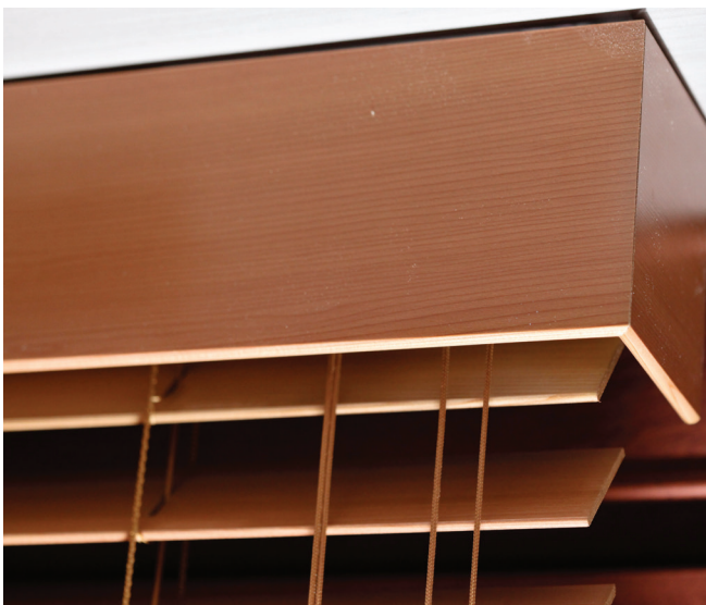
Close-up of Flat Pelmet