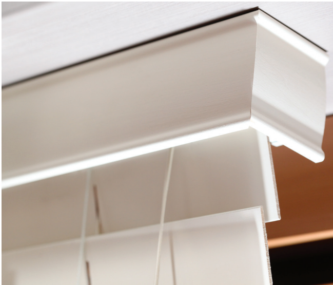
Close-up of Harbour Style Pelmet

Timber and Timber Look Venetians come with a 3 Year warranty.